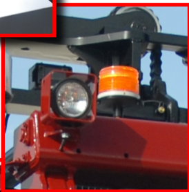
Lights & Beacon