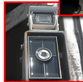
Cameras & Motion Alarms